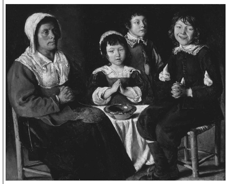
Antoine Le Nain (French, ?-1648). Le Bénédicite (The Blessing) . n.d. Oil on copper. Frick Art & Historical Center.

People who enjoy art often have to be detectives. They may want to know when a painting was created, what it is a picture of, or who the artist was. For some paintings the answers are easy, but for others it takes lots of research to figure out their secrets.