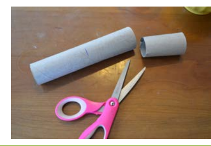
f you don't have a toilet paper roll you car use a paper towel roll. Cut the roll into thirds before you begin.