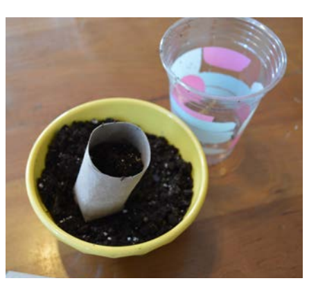
Step 3: Fill the tub with soil and place your seed!

Step 1: Cut four slits into one end of the roll. The cuts should be no longer than 1 inch.