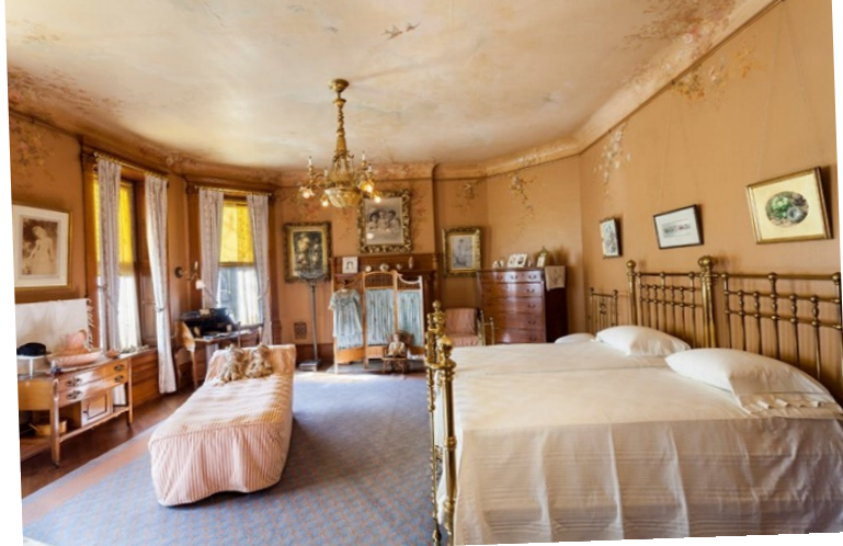
Helen Clay Frick and her dog (top). Helen's bedroom in Clayton (bottom).

Now it's your turn! On another piece of paper, complete Mademoiselle Ogiz's writing assignment by describing your bedroom and what you like most about it. What does your room look like? Do you share the room with someone? What is your favorite thing about your room, and why?