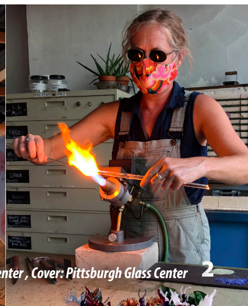
Pittsburgh Zoo (Paul Selvaggio), Contemporary Craft, Pittsburgh Glass Center, Cover: Pittsburgh Glass Center